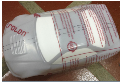
Car body vacuum formed on a Formech 508FS

ter experimenting with some PC material at home it became clear to Alessandro that a professional grade machine would allow him to produce more consistent results, which saved material and therefore money.