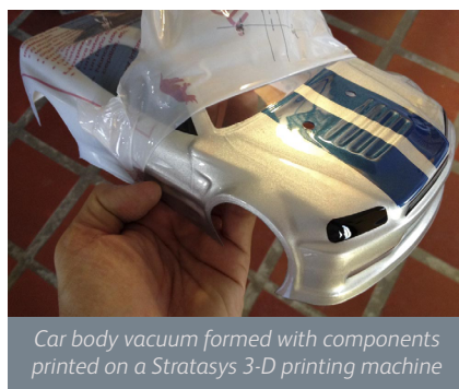
Car body vacuum formed with components printed on a Stratasys 3-D printing machine

Formech worked with Alessandro to help him source the right material and also advised on how to create the best type of tooling for his process.