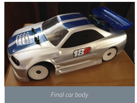
Final car body