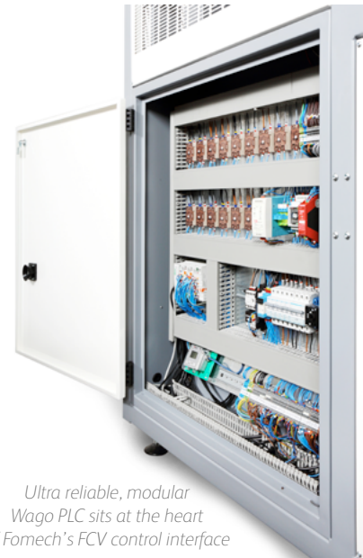
Ultra reliable, modular Wago PLC sits at the heart of Formech's FCV control interface

Featured on all Formech automatic series and select semi-auto machines, 'FCV' (Formech Cycle View) introduces a new level of intuitive control. Designed to mirror modern control platforms such as tablets, IOS and Android devices the graphically driven interface is easy to understand and navigate for less experienced users.