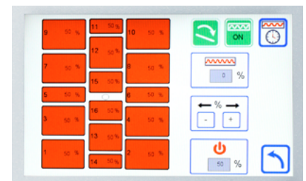
Intuitive Heating Control

Optional advanced functions such as remote monitoring and password activation are available as required.