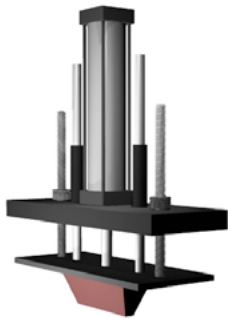
Plug assist as standard

International customer feedback has proved instrumental to developing a highly accessible user interface for operators of all experience levels. Easy to understand icons and a help feature in the customer's native language provide descriptions of all functions.